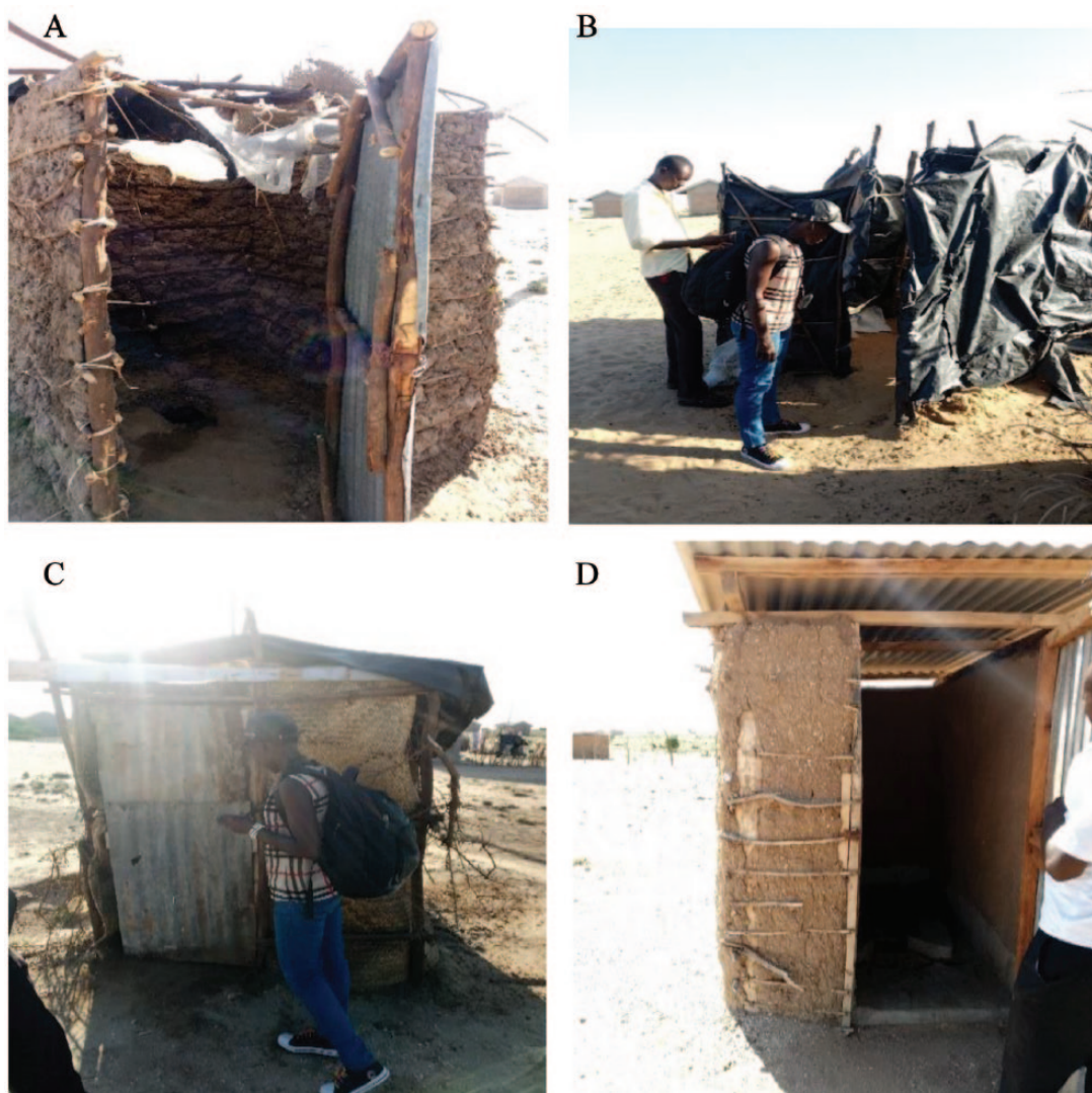
Figure 2. Figure A,B,C and D Showing the nature of latrine facilities in the study area.