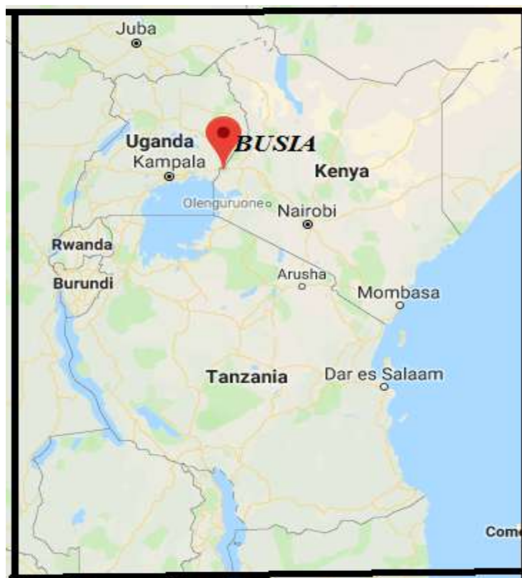
Figure 1 Map of the study area.

Busia County is one of the 47 Kenyan Counties neighboring Bungoma, Kakamega and Siaya Counties respectively in western Kenya. The County is characterized by a tropical climate with average temperatures of 22 degrees centigrade and average rainfall of 1691 mm per annum. The coordinates of the county are 0.4347° N and 34.2422° E respectively. The map of study area is shown in figure 1 below. This study makes attempts to examine the concept of advection and uses a HYSPLIT model to predict the flow of pollutants in Busia County, Kenya.