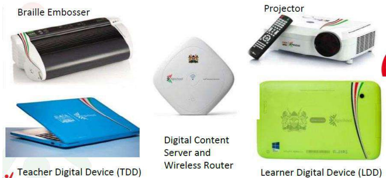
Figure 1: Digital Devices

A study by Kamau (2014) showed that a variety of restrictions hindered teachers from integrating ICT into their classes, including teachers who lacked the required training for ICT adoption in learning, lacked ICT tools and facilities and lacked time; lack of institutional support; and school principals who lacked ICT expertise to integrate ICT into their school leadership positions. In Kenya today, more than 89.2 percent of all public primary schools have been equipped with the Digital Learning Programme (DLP) tools: Learner Digital Devices (LDDs) 981,085; Teacher Digital Devices (TDDs) 38,768; Digital content Server and Wireless Router (DSWR) 19,384 and Projector 19,384 as indicated in figure 2.1, over 91,000 teachers have been trained on device utilization, an improved number of pupils' enrolment in Basic Education, has been realized and over 95% of schools are connected with power (Mugo, 2017). Therefore, the current study evaluated the indicators of ICT Integration in basic education to measure the level of ICT integration for collaborative learning.