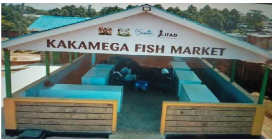
Figure 3: Modern fish market in Kakamega town

In examining the effect of market availability on fish farming in Ikolomani Constituency, Kenya, the majority of fish farmers 86.6% pointed out that there is a big market for fish in the County, only 13.4% reported otherwise. This is confirmed in the ICDP 2023-2027 where it was reported that the market for fish is on steady growth in the County (ICDP, 2023).