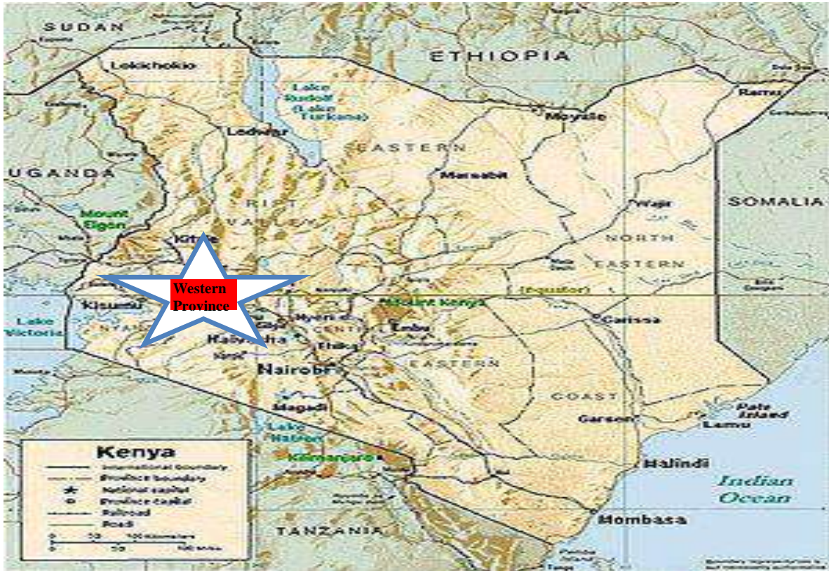
Appendix 1a. Map of Kenya showing western province.