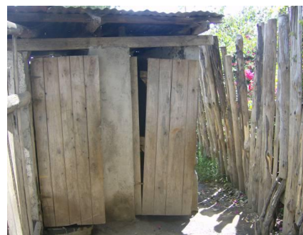
Photograph 4. Notable is the falling of door