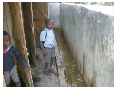
Photograph 2. Note the stagnant urine