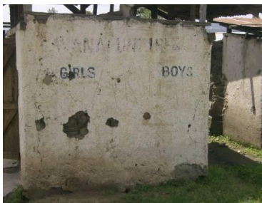
Photograph 1. Existing sanitation facility