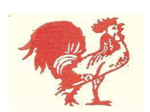
Fig.5 Party Symbol and Colours of KANU

According to the ancient Greeks, the rooster rose to attention and saluted the sun every morning with a hearty cry, symbolising victory over night. As such, the rooster was considered a solar emblem to the Greeks and was adopted as a sacred sign to the god Apollo, Zeus, Persephone and Attis. In politics, it stands for victory of a dark age during which the citizens suffered. At its inception, Kenya like many other African countries had suffered in the hands of colonialists. The rooster gave them hope of an end to their suffering. Its crowing early in the morning makes it a dependable figure to humanity. It then symbolises punctuality and constancy. It is associated to the saying "Rise and Shine". This means that you have something to accomplish and the time to rise and shine is now. Self-empowerment begins with that first brave step into the dawning of a new day. The rooster is therefore the timekeeper of the world. KANU leaders would marshal the citizens to work to develop the nation. Its political philosophy "KANU yajenga inji" in the current situation would not augur well since many Kenyans who work hard don't realise the value of their sweat. The country is full of protest and workers' strikes.