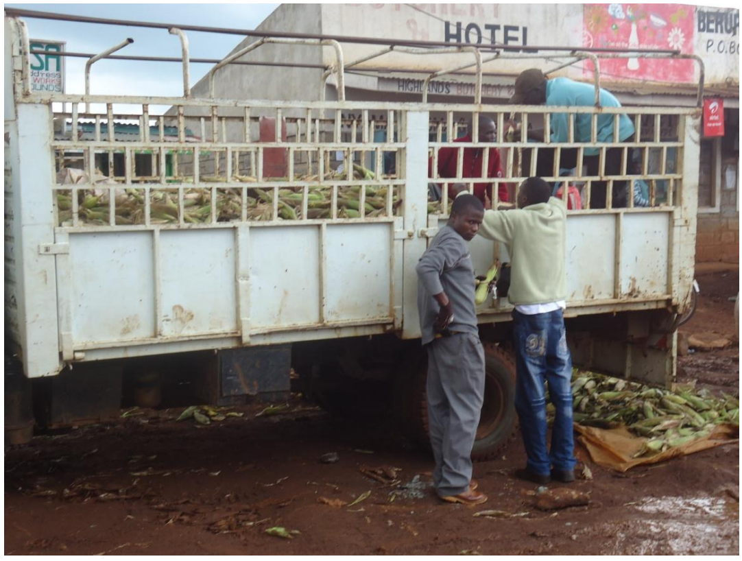
Plate 1: Green maize truck lorry at several stop over between while on the business.

The clip shows a ready maize farm, which according to the farmer is like cash at hand depending on the arising needs. The owner of the ten acre farm believes that it is upon the government to protect the farmers from constant exploitation from the middlemen. This farmer openly expressed fear of dry maize prices and that is why he was preparing to sell green maize.