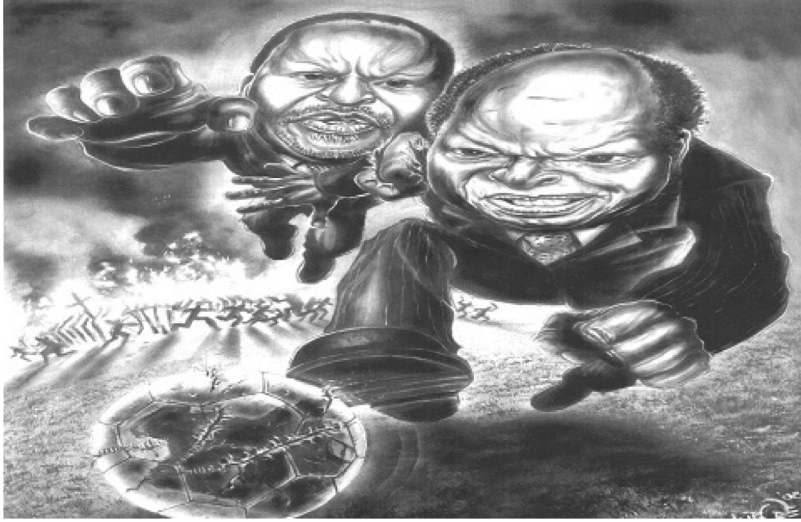
Figure 1. Cartoon 1.

possession of the ball (presidency) and trying to obstruct Mr Odinga from reaching it. Mr Raila, on the other hand, is also ridiculed for his attempting to grab the ball. This is clearly seen in the gestures of his hands. One wonders why such respectable and honorable figures, as can be seen in visual modes of dressing, should ignore people's suffering and fight over a ragged ball. If it were in speech, the rhetor's ethos would include visual aspects such as appearance and manner of delivery. In visual arguments, the rhetor's ethos sometimes may be inferred from the visual work itself or from the rhetor's oeuvre. The visual modalities of the two leaders imply their status and power, hence one would expect them to adopt a rational way of handling a crisis, yet they chose to do it the ugly way. This demeans them as honorable leaders.