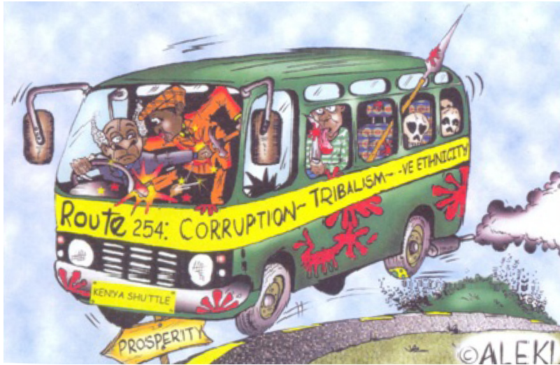
Figure 3. Cartoon 3.