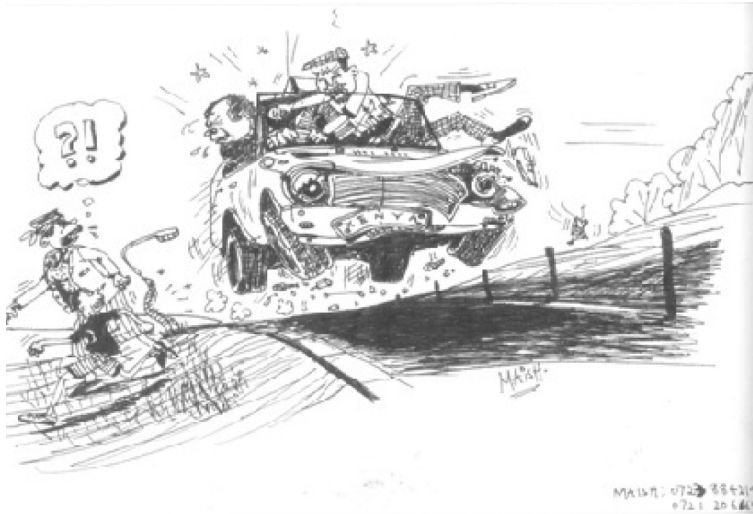
Figure 4. Cartoon 4.